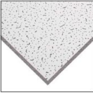
Bajkal 90% RH Board